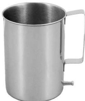
Irrigatoren Irrigator Irrigateurs Irrigadores Irrigatori