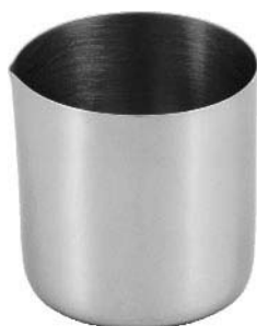
Becher Cups Récipients Tarros Recipienti

Ø x H 88.150.02 75x 75 mm 0.25 Liter 88.150.05 100x 85 mm 0.50 Liter 88.150.07 115x100 mm 0.75 Liter 88.150.10 125x125 mm 1.00 Liter