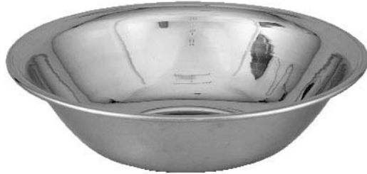
Waschschüssel Wash Bowls Cuvettes Palanganas Scodelle per liquidi