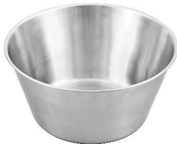
Runde Schüsseln Round Bowls Cuvettes rondes Cubetas redondas Scodelle rotonde