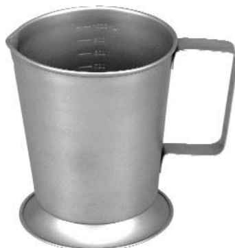
Meßbecher Measuring jugs Gobelets gradués Copas graduadas Misurino