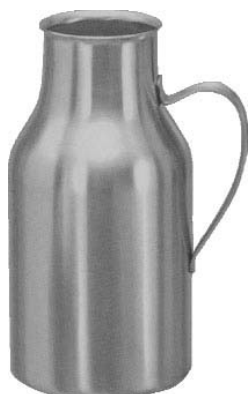
Urinal Urinal Urinal Urinal Urinale