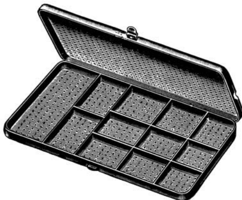
SAUERBRUCH 88.110.21 210x125x17 mm

Deckel und Boden perforiert perforated lid and bottom couverture et fond perforé tapa y fondo perforado coperchio e fondo perforati