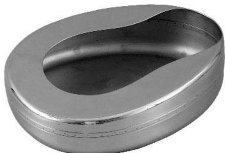
Stechbecken, amerik. Form Bed pan (american pattern) Bassin de lit (modèle américain) Silletas (forma americana) Padelle (modello americano)