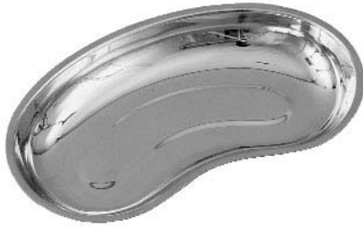
Nierenschalen Kidney bowls Bassins réniformes Riñoneras Padelle reniformi