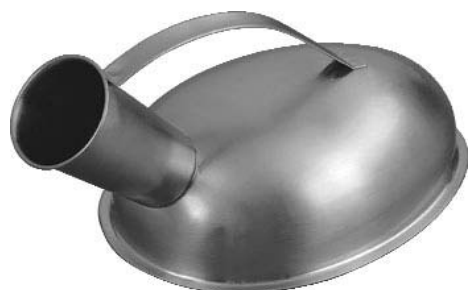
Urinal für Männer Urinal male Urinal homme Urinal hombre Urinale uomo