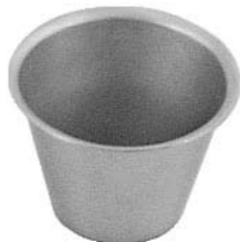
Medizinbecher Medicine Cups Gobelets Vasos graduados Bicchieri per medicinali