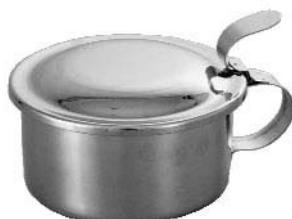
Sputumbecher Sputum Cup Crachoir Escupideria Sputacchiera