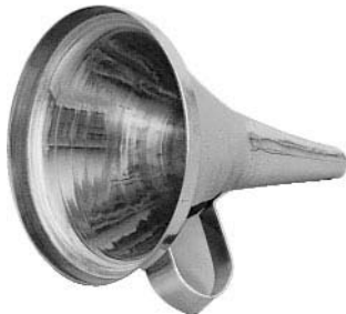
Trichter Funnels Entonnoires Embudos Imbuti