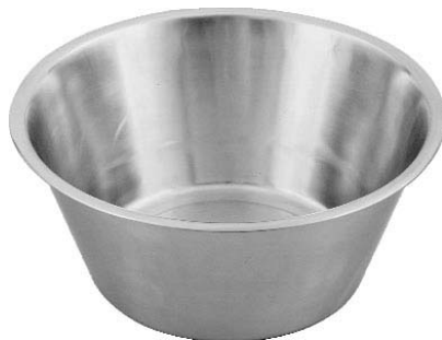
Spülschale Solution Bowls Cuvettes rondes Cubetas redondas Scodelle rotonde