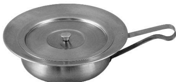
Stechbecken Bed pan Bassin de lit Silletas Padelle