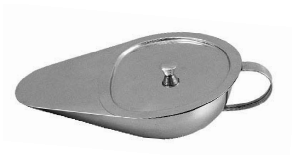
Stechbecken Bed pan Bassin de lit Silletas Padelle