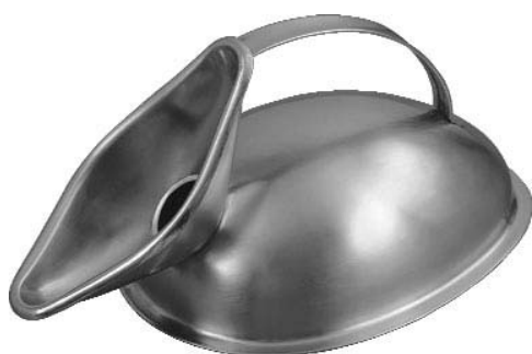
Urinal für Frauen Urinal female Urinal femme Urinal mujer Urinale donna